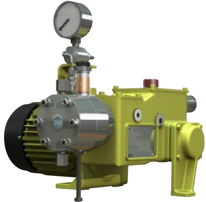
Figure 3 -DSD liquid end on a Milton Roy MilRoyal D