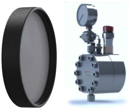
Figure 2 -DSD PEEK diaphragm and liquid end assembly